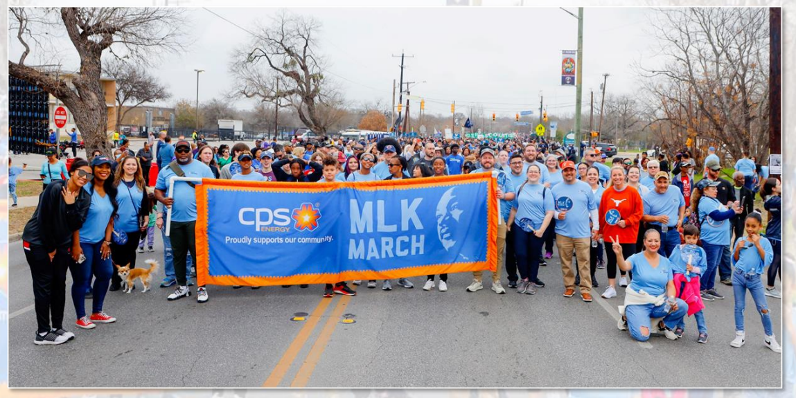
CPS Energy employees, retirees, family, friends, & Students of Service participants during the 2023 MLK March.