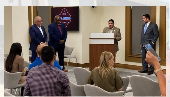
July 11 - Joint Operational Update from COSA, CPS Energy, SAWS, VIA

ERCOT ISSUES WATCH, APPEALING FOR ENERGY CONSERVATION STATEWIDE; CPS ENERGY URGES CUSTOMERS TO CONSERVE ENERGY