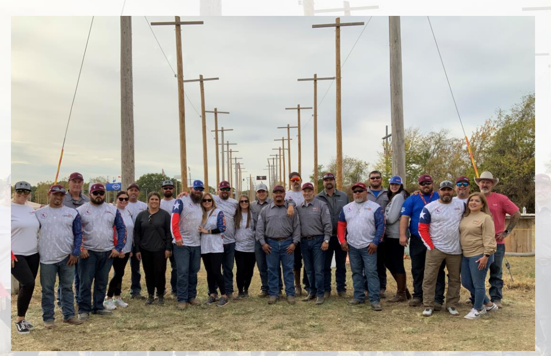
All smiles from our Rodeo Team after a great competition.

Job well done to our very own International Lineman's Rodeo team for representing us at the competition on October 15, 2022. We had a chance to show off how we safely perform our different lineman's work tasks.