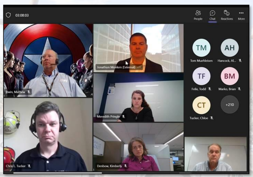
Virtual meeting breakout rooms for Cyber & Physical Security & Operations groups